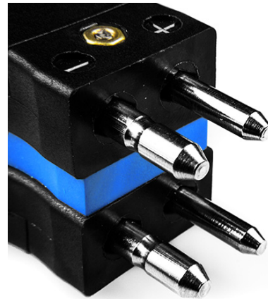
Standard Duplex in-line Plug (dimensions in mm)

Labfacility are the UK's leading manufacturer of Temperature Sensors, Thermocouple Connectors and associated Temperature Instrumentation and stockings of Thermocouple Cables. The Company has been trading since 1971 and is ISO9001 accredited.