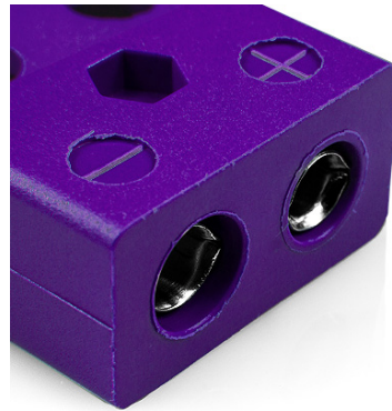
Standard in-line Socket - Quick Wire (dimensions in mm)

Labfacility are the UK's leading manufacturer of Temperature Sensors, Thermocouple Connectors and associated Temperature Instrumentation and stockings of Thermocouple Cables. The Company has been trading since 1971 and is ISO9001 accredited.