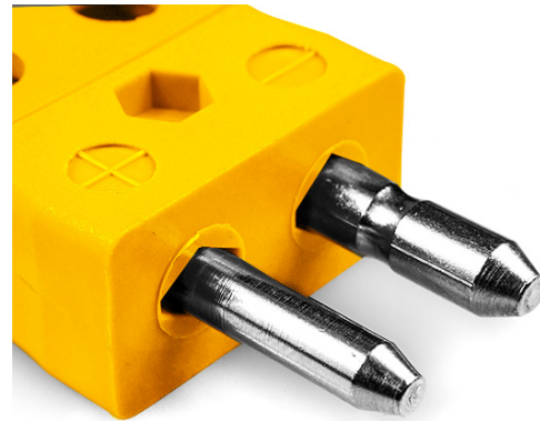
Standard in-line Plug - Quick Wire (dimensions in mm)

Labfacility are the UK's leading manufacturer of Temperature Sensors, Thermocouple Connectors and associated Temperature Instrumentation and stockings of Thermocouple Cables. The Company has been trading since 1971 and is ISO9001 accredited.