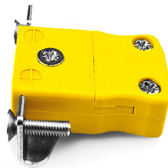
Miniature in-line Socket with stainless steel mounting bracket (dimensions in mm)

Labfacility are the UK's leading manufacturer of Temperature Sensors, Thermocouple Connectors and associated Temperature Instrumentation and stockings of Thermocouple Cables. The Company has been trading since 1971 and is ISO9001 accredited.