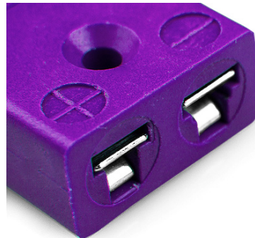
Miniature in-line Socket (dimensions in mm)

Labfacility are the UK's leading manufacturer of Temperature Sensors, Thermocouple Connectors and associated Temperature Instrumentation and stockings of Thermocouple Cables. The Company has been trading since 1971 and is ISO9001 accredited.