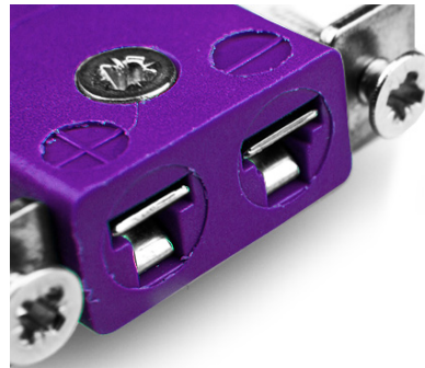
Miniature in-line Socket with stainless steel mounting bracket (dimensions in mm)

Labfacility are the UK's leading manufacturer of Temperature Sensors, Thermocouple Connectors and associated Temperature Instrumentation and stockings of Thermocouple Cables. The Company has been trading since 1971 and is ISO9001 accredited.